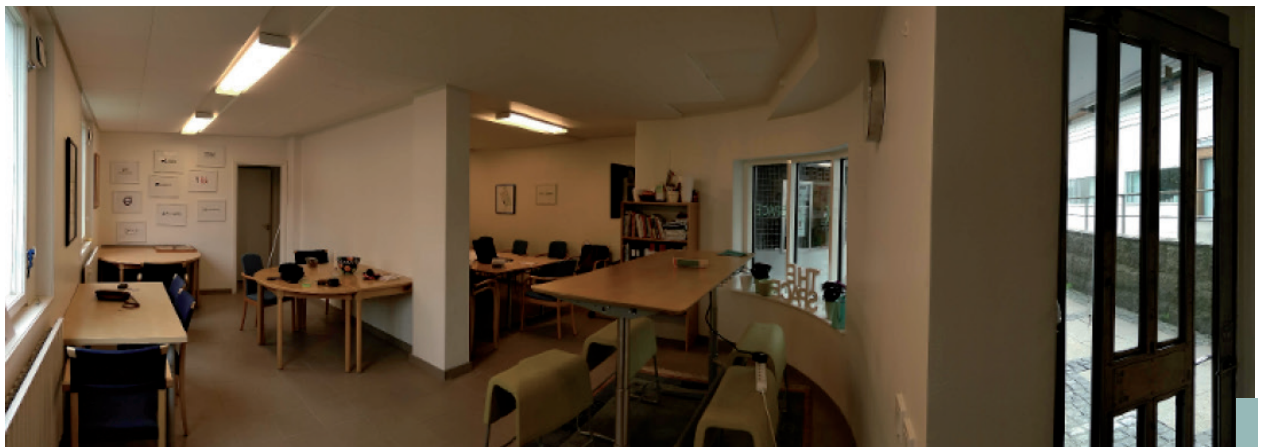
Our lovely, and recently redecorated, Bergsjön office