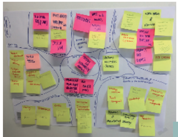
Another cool product of a fruitful brainstorm session