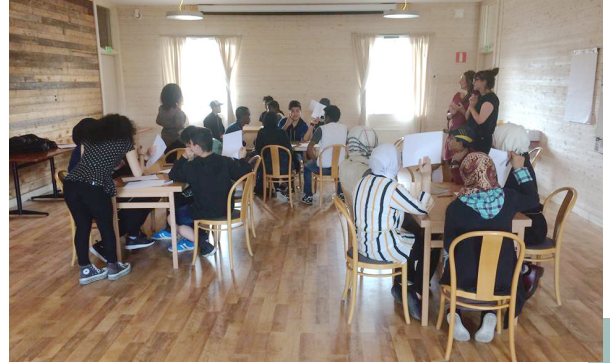
Workshop in Entrepreneurship Camp in Angered