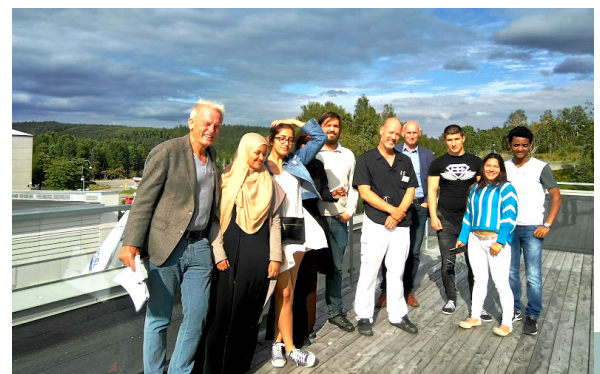
Visiting Health Care Center (Bergsjön Vårdcentral)