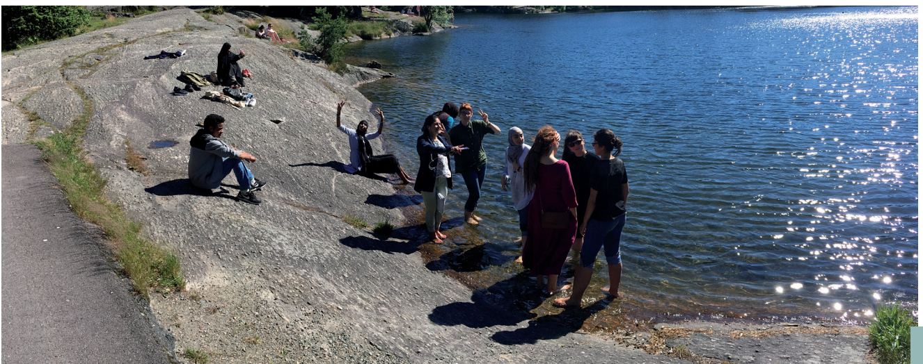
First visit at the lake